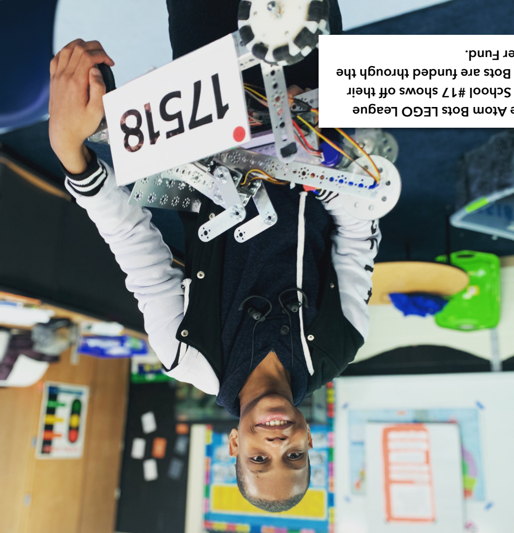
A member of the Atom Bots LEGO League robotics team at School #17 shows off their robot. The Atom Bots are funded through the Dr. Walter Cooper Fund.